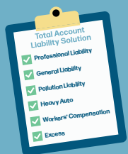
Total Liability Solution