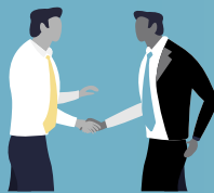
One Dedicated Underwriter