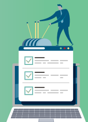
Flexible Policy Forms