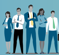
In-House Claims Team